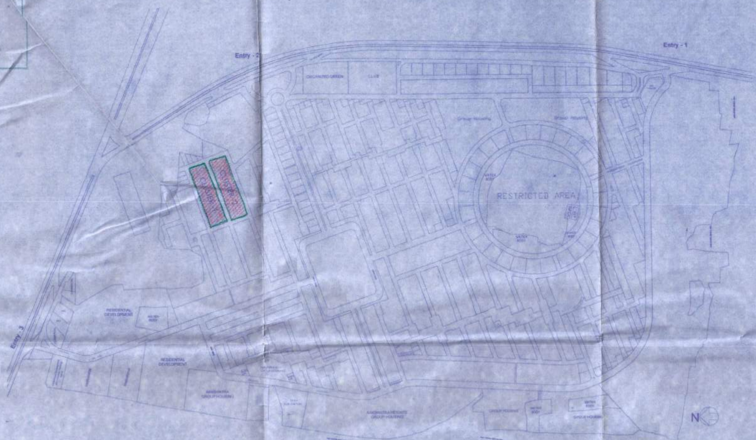
LOCATION PLAN OF CLUSTER SCALE: 1:200